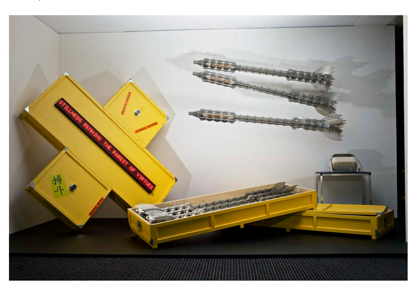
Supereste ut Pugnatis (Pugnatis) ut Supereste, photo Ian Hobbs.

Manifest as an architecture of power the membrane is the portcullis and drawbridge regulating access to a Norman Castle. A filter of economic privilege to the VIP lounge and the algorithm that structures the flow of surveillance information at airport security.