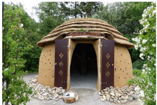
FIGURE 8. The Oratorio at Buitenpost Gardens. Image Nigel Helyer.

However, recent research turns this pyramid image upon its head. Consider for a moment the behaviour of bees in Swarming mode. The hive has grown and the colony divides. The outgoing group musters, hanging from a branch somewhere, seeking a new location. The swarm sends out a stream of scouts, often over a period of days, who report back, using methods similar to the bee dance to relay complex qualitative information. Somehow a collective process is engaged, the swarm considers this growing matrix of spatial data and eventually they fly to the most favoured location to begin a new colony. This is not the work of an individual mind, it is a product of parallel processing, a natural neural network, if you like, that has evolved over a 100 million years, the hive as super-organism .