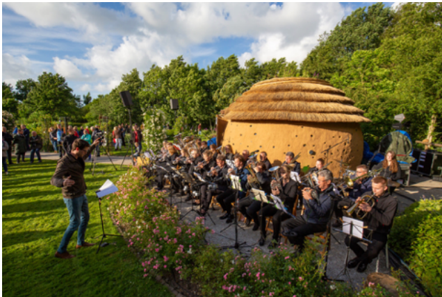
FIGURE 09. The Oratorio concert.

Physically each Oratorio is constructed in traditional wattle and daub, intricately hand woven willow branches plastered with a thick layer of Leem 7 with a form based upon the shape of a traditional woven straw beehive (a Skepp in English). The structures have a thatched roof reminiscent of the traditional farming buildings of the region, and this in turn supports a green-roof — sown with Bee attracting flowers — a sort of Bee-Helipad! The hemispherical interior of the Oratorios provide a special acoustic, similar to that found in the domed roofs of Cathedrals and Mosques where sound loses its directionality and forms an omni-directional soundcloud .