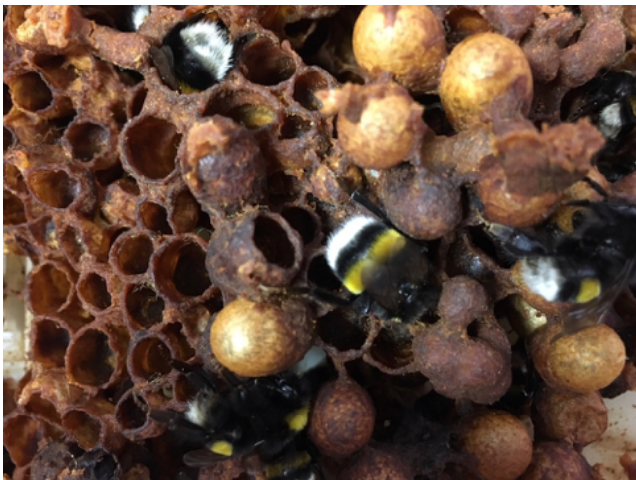
FIGURE 7. A Bombus Terrestris nest.

Why Bees? — There are two main reasons for such interest — firstly Bees, along with other colonial insects (such as termites and ants) display striking social organisation — that since ancient times they have provided powerful metaphors for human social structures. Secondly Bees have become a focus species in the public debate about the environment. Unfortunately the focus upon the threat to Bees; on Colony collapse and the subsequent effect on food production frequently masks the even wider issues of diminishing Bio-diversity in the face of industrial culture; agribusiness and climate change.