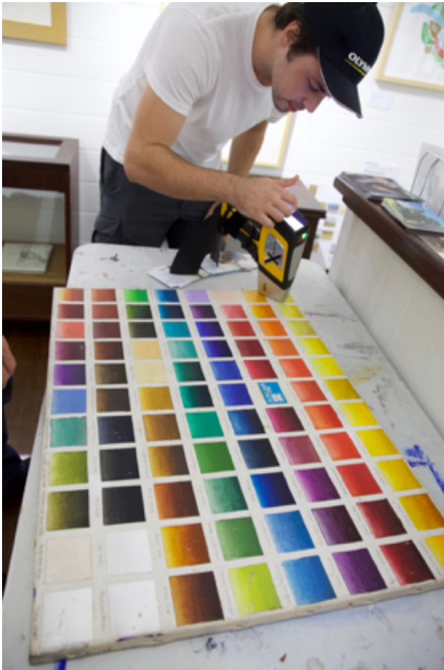
Figure 2. Chemical sampling of studio paints.

The second stage was to sample the Steinway piano at the Bundanon homestead, note by note. Firstly, we recorded regular keystrokes; secondly, we recorded the reverberance of the sounding board resulting in one to two minute sound files per note. Working with another colleague, Jon Drummond, who is an expert in data sonification, we created a computer-driven audio-visual system able to read the video