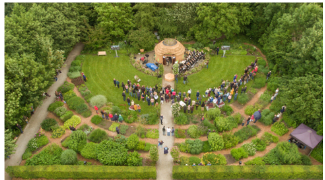
FIGURE 10. B_Rhapsodie in performance.

The province of Fryslân in the Netherlands and the adjacent area of OstFriesland in Germany boast many talented town Brass Ensembles and we were also commissioned to create a series of musical scores derived from the sounds and data sets recorded in the Oratorios, that could link each of the sites. By analysing the harmonic range of hive recordings we derived a tonal palette that we quantised into an equal tempered scale. Likewise by analysing the Bee entry and exit data from a range of the citizen science hives we established a temporal or rhythmic framework as well as developing an overall compositional structure based upon the diurnal activity of a hive (which is related to light and temperature).