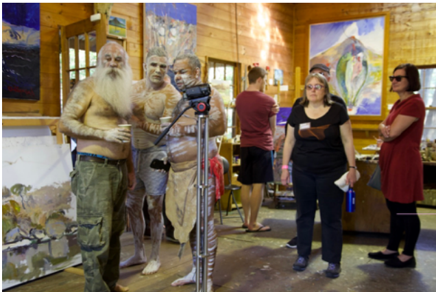
FIGURE 4. In the studio with Elders from the Wreck Bay community.

Heavy Metal is interactive at a complex and conceptual level. The composition of chord-like sounds (recorded from the homestead Steinway) is created by a real-time analysis of the minerals in the colours of an unfinished Boyd painting, Return of the Prodigal Son (c1997). As a video camera is trained onto a section of the canvas, the screen displays the mineral content of the selected colours, in the form of the periodic table. The image and corresponding sound change each time someone selects a new section of the canvas on which to train the camera. Heavy Metal also brings together two kinds of science: environmental and computational.