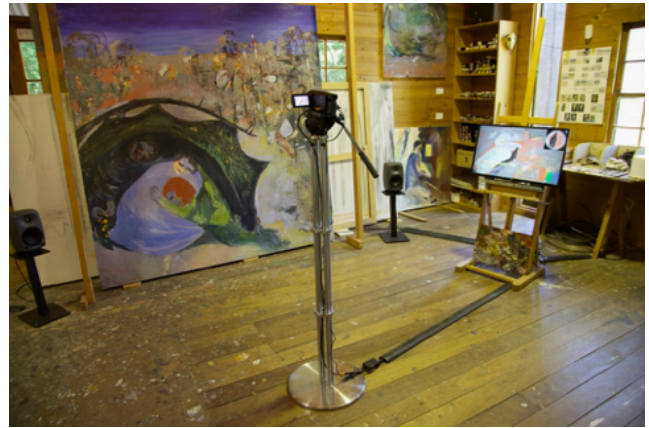
FIGURE 5. The camera vision system, screen and target painting.

Heavy Metal. The studio stays open for several hours longer than scheduled, and many visitors come back more than once. As the sounds from the studio close down, the chorus of the frogs in the nearby lake take over in the dark of evening at Bundanon.