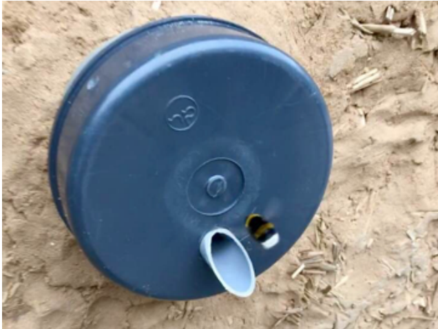
FIGURE 11. A BumbleBee about to enter the Oratorio.

resonating with the sound energy from the four channel speaker array. The solution was provided by wiring together two large format Piezo discs and mounting them onto a small sounding board placed onto the upper surface of the nest enclosure. This extremely low-tech approximation of a contact microphone delivered good sound fidelity without the problems of feedback.